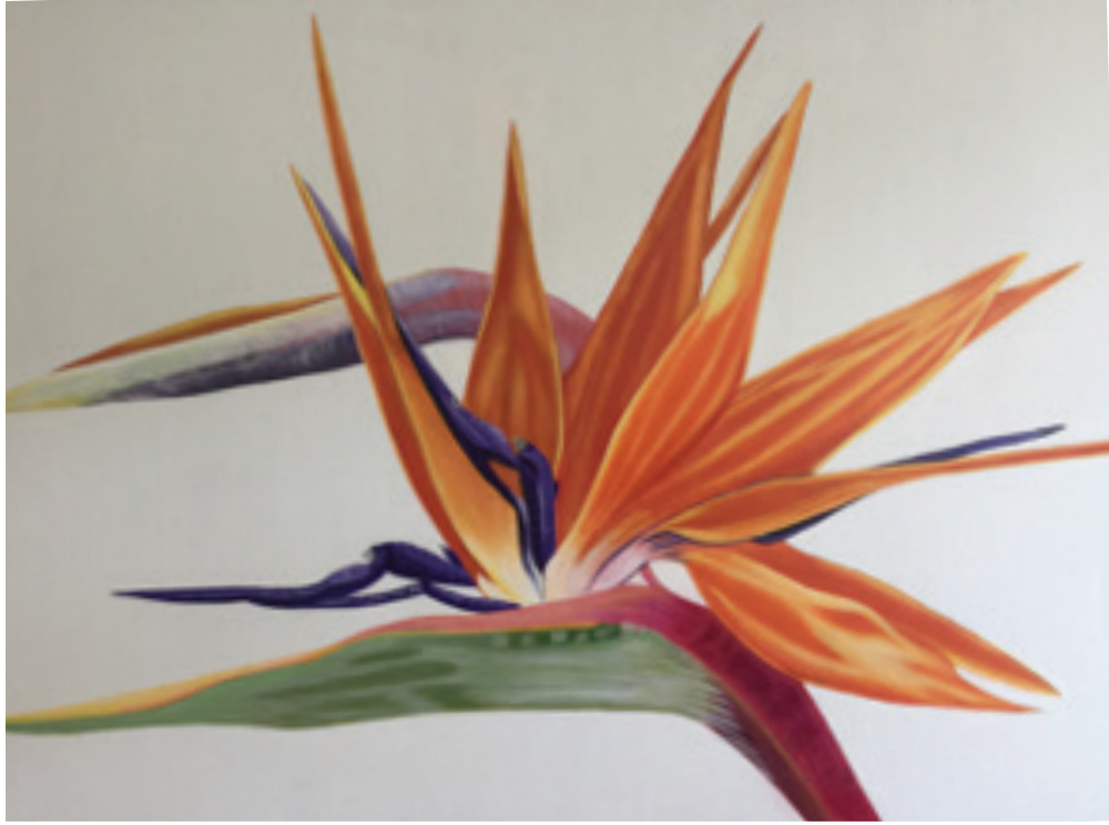
Bird of Paradise 96 x 101 acrylic on canvas