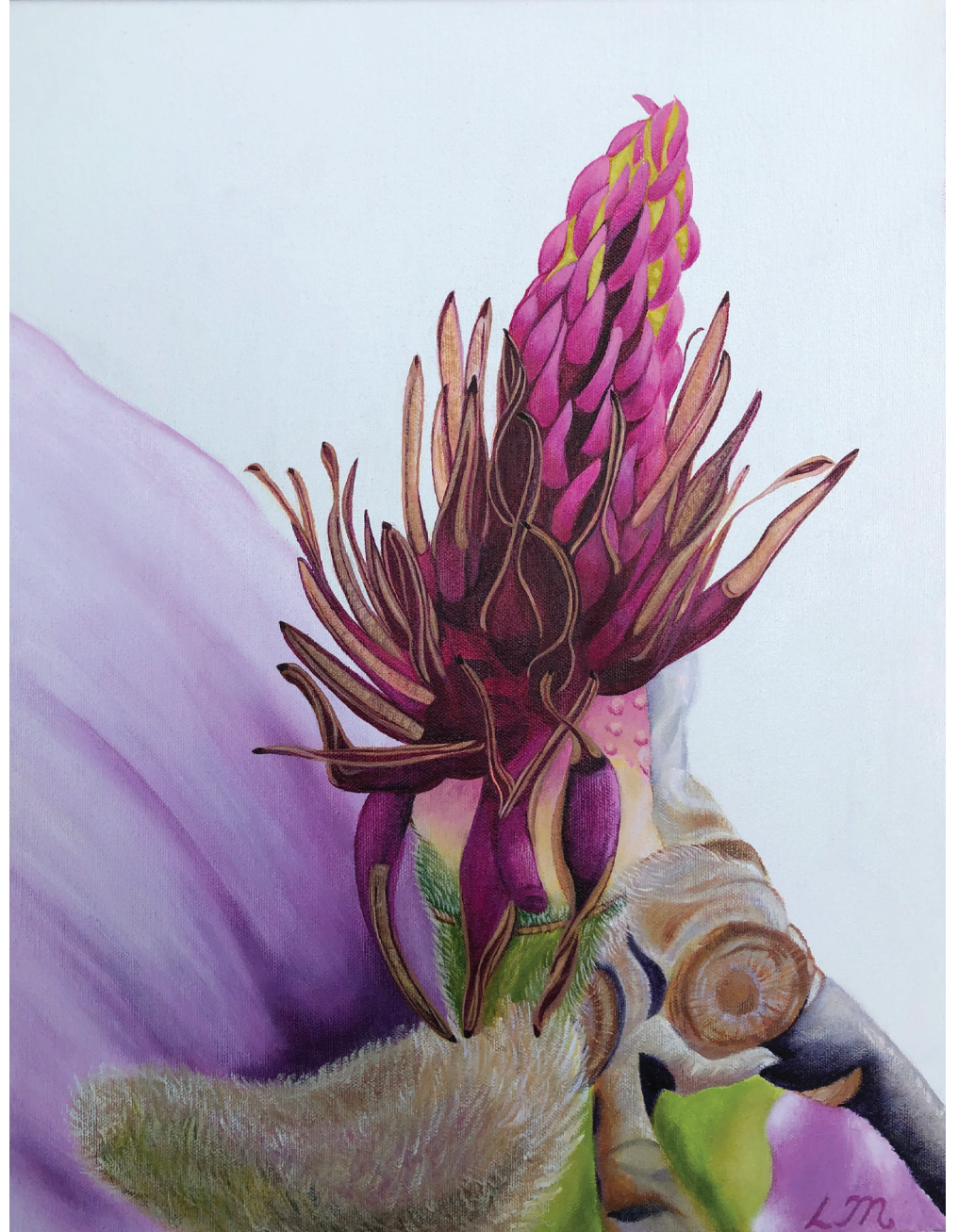
Stigma 35cm x 45cm