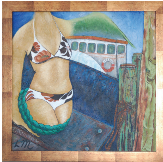
The Dock 65 x 67cm acrylic on board