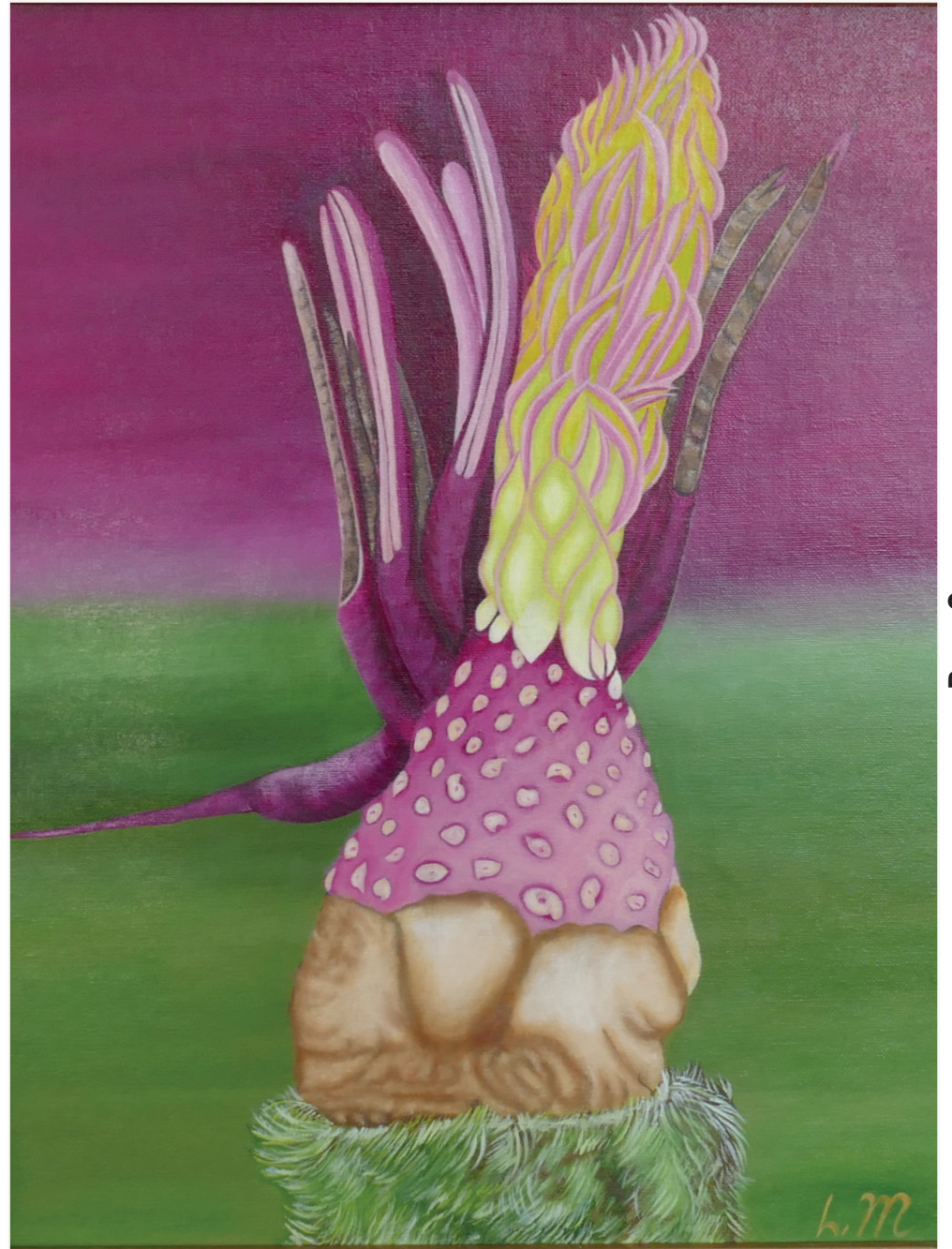
Falling Petals 41 x 51cm acrylic on canvas