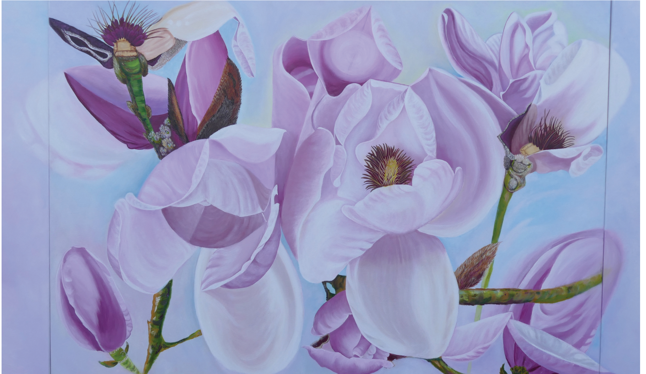
Magnolia Small 115cm x 81cm acrylic on canvas