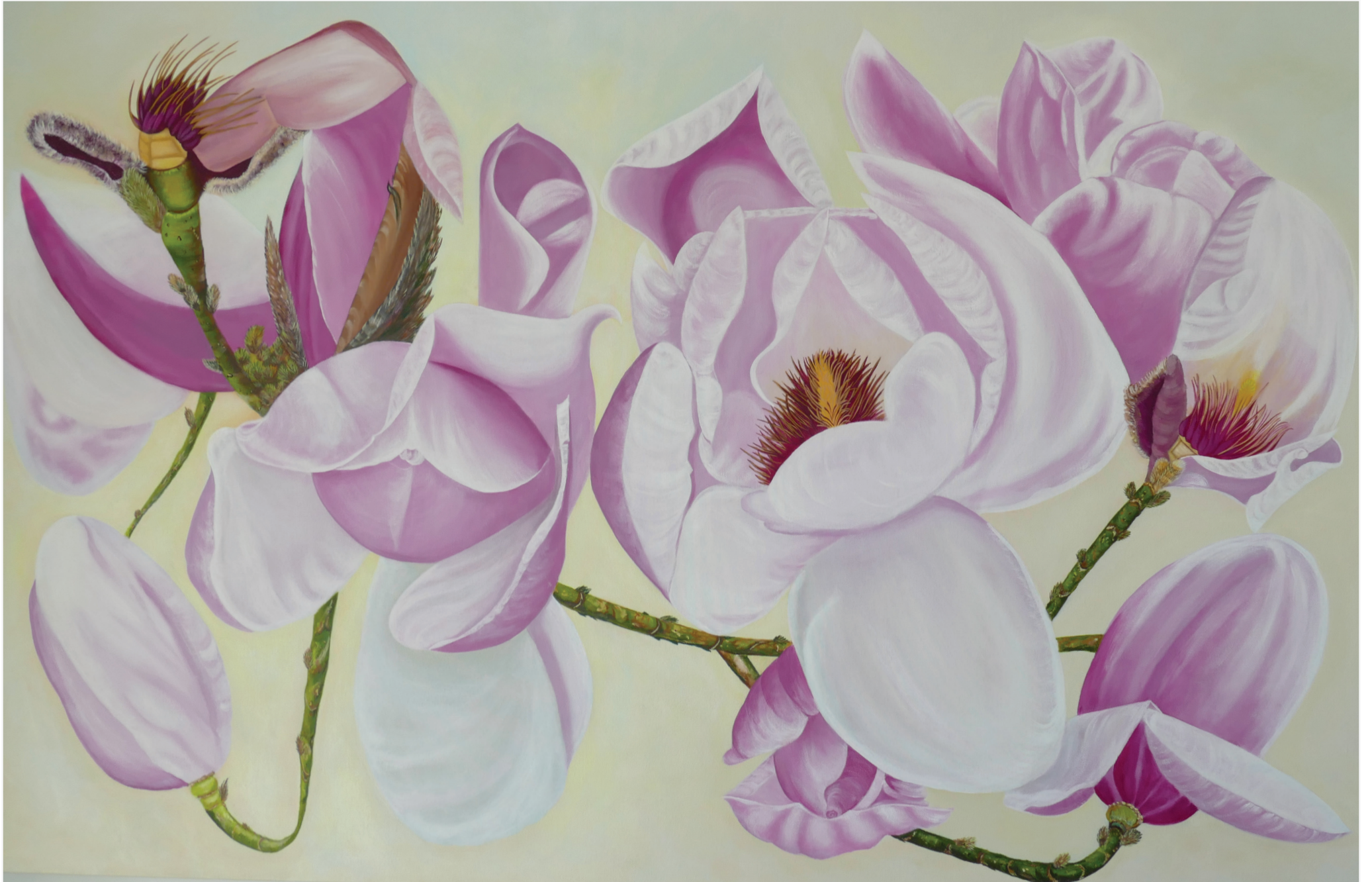
Magnolia Large 153 x 98 cm acrylic on canvas