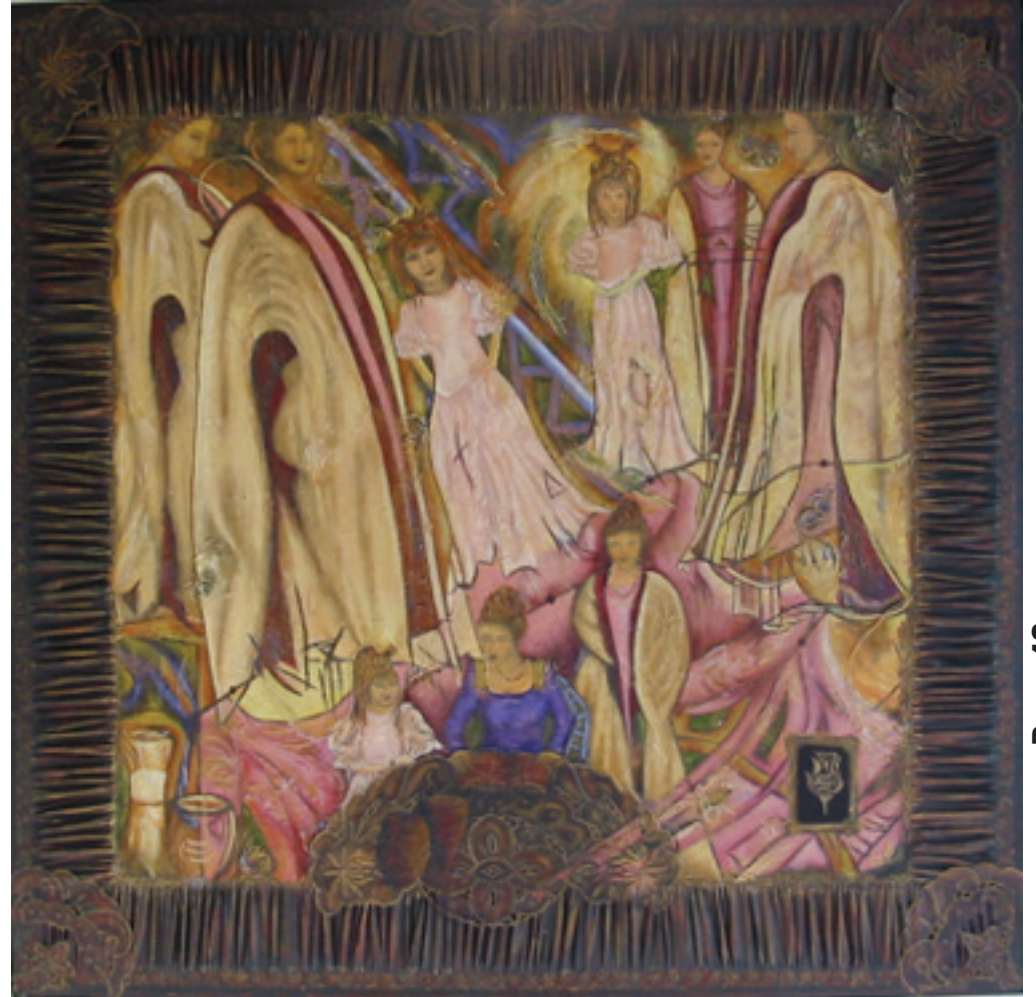
The Registration Acrylic on canvas 112cm x 114