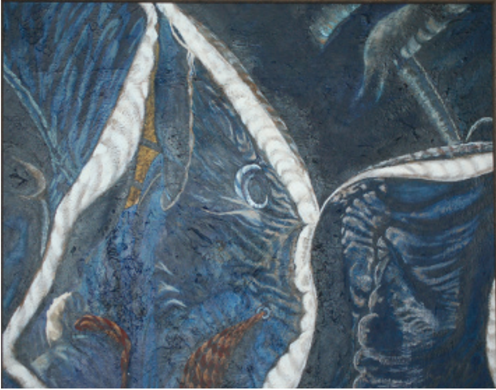
Eyelet 74 x 90 cm 2009 acrylic on board