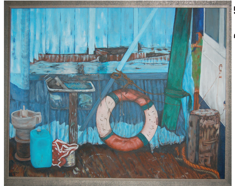
The Workshop Acrylic on board 60 x 76 cm