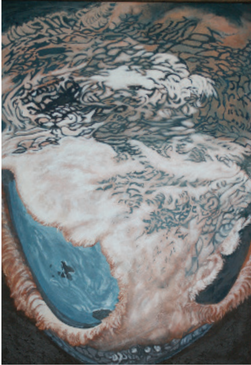
Beast of Burden acrylic on board, 86 cm x 60 cm