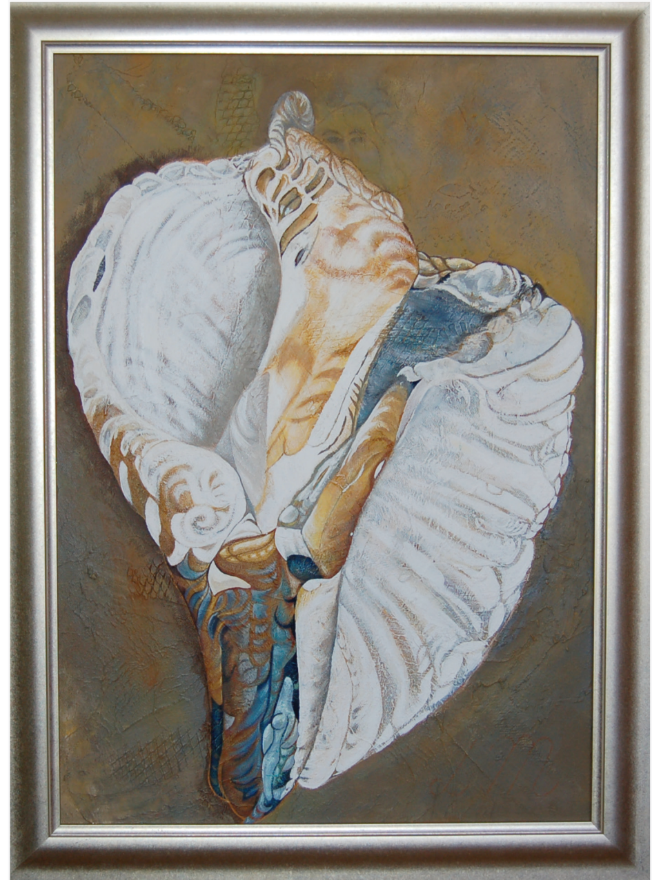
Shell of Aoreoa Acrylic on board 54 cm x 76 cm