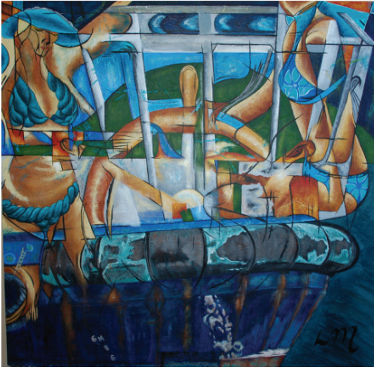
The Helm 99 x 96 cm acrylic on board