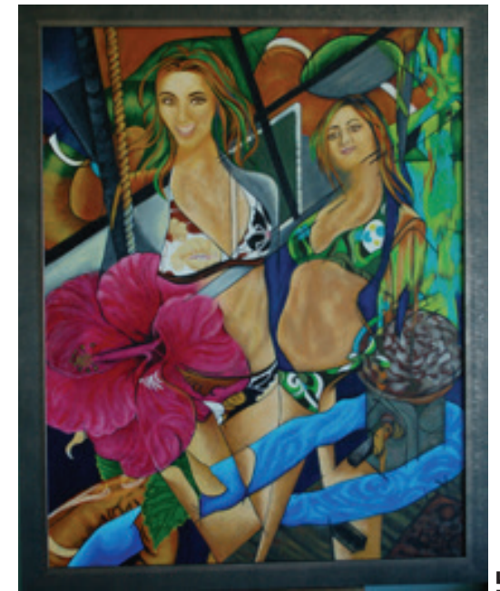
A Kiwi Summer 66 x 83 cm