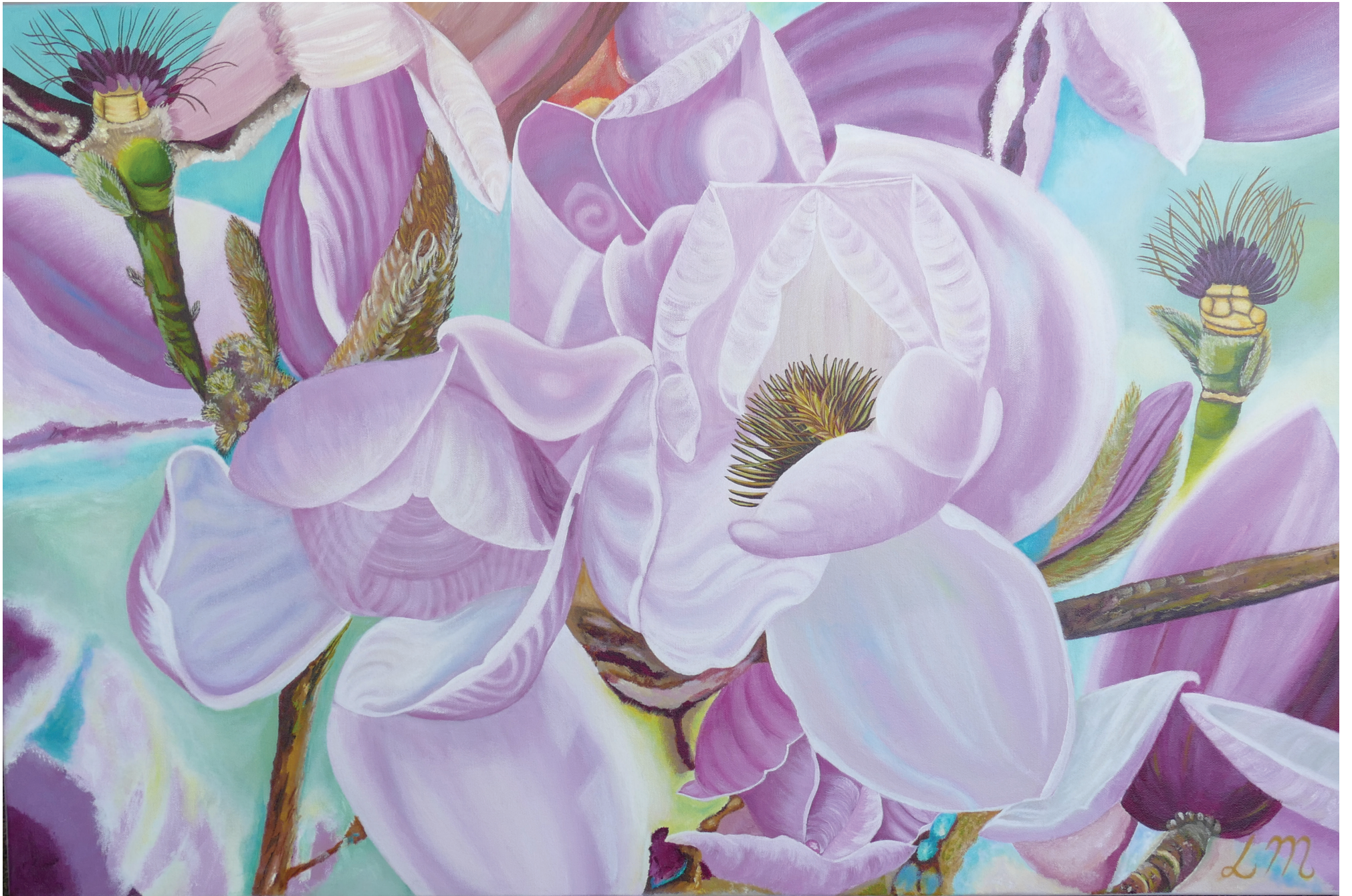
Glowing 91 x 61 cm acrylic on canvas