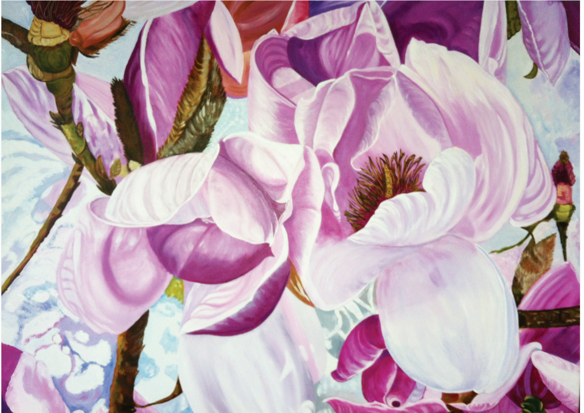
Magnolias 2 110 x 61 cm acrylic on canvas