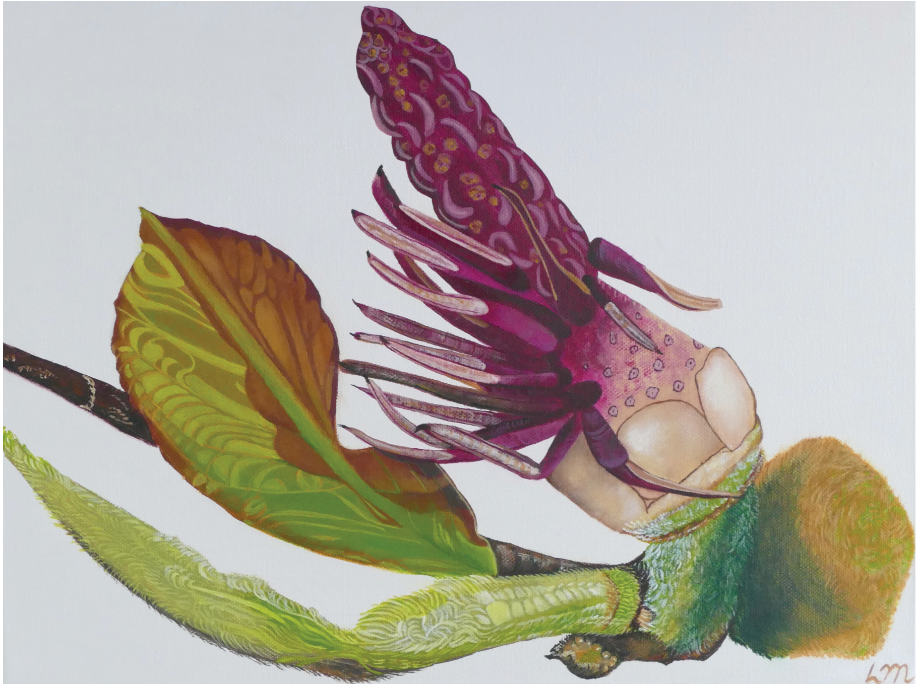
Carpels 41 x 31cm acrylic on canvas