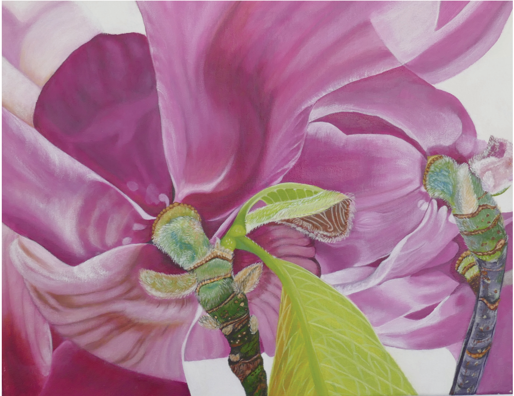
Receptacle 76 x 110 acrylic on canvas