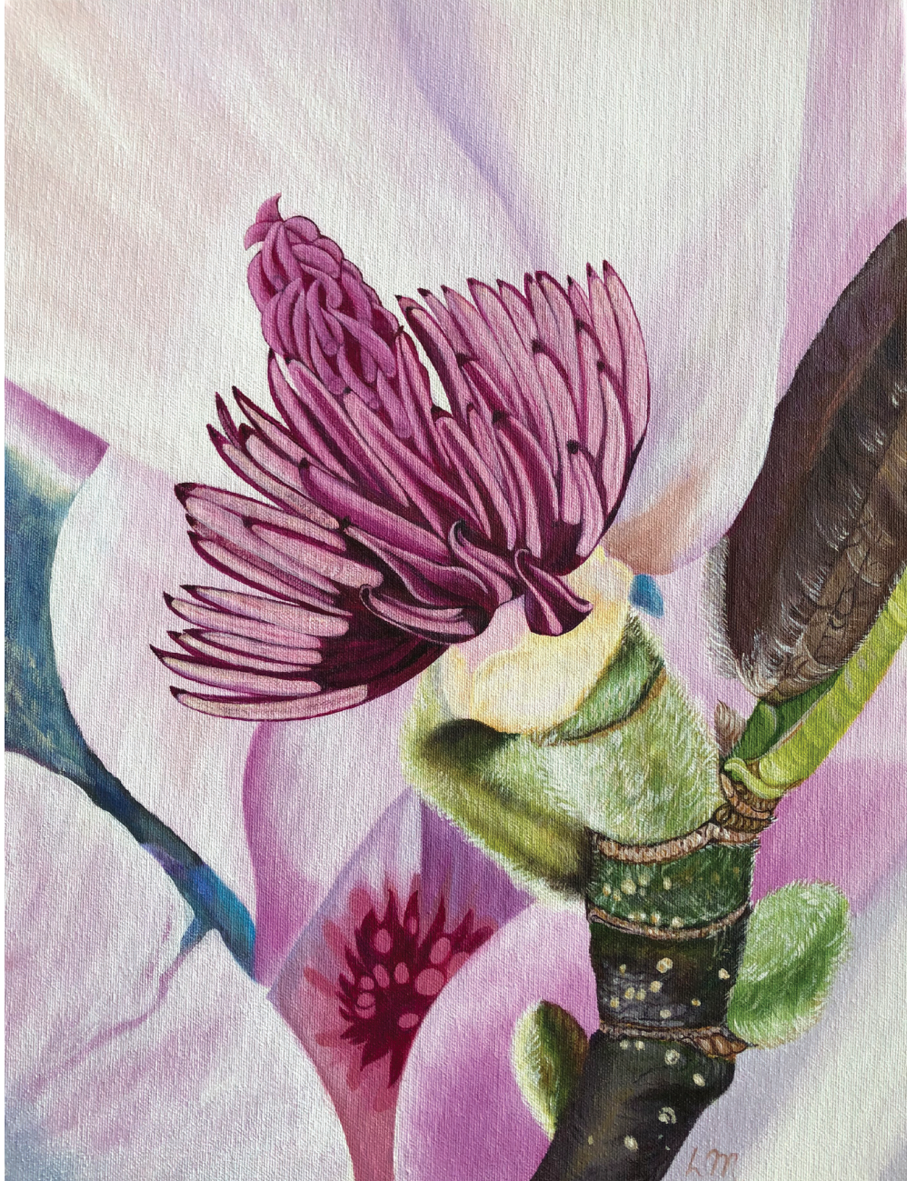
Pedisal 35cm x 45cm