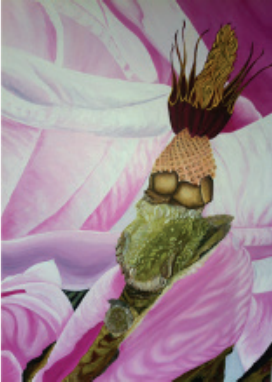
Stigma 80 x 90 acrylic on canvas