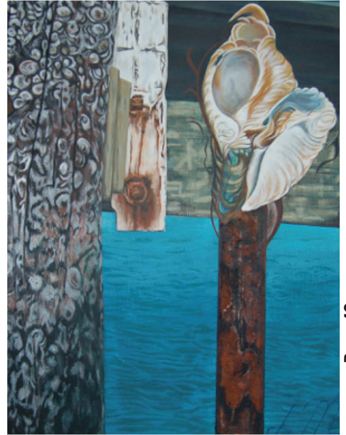
Lace Oyster 84 x 67c m acrylic on board