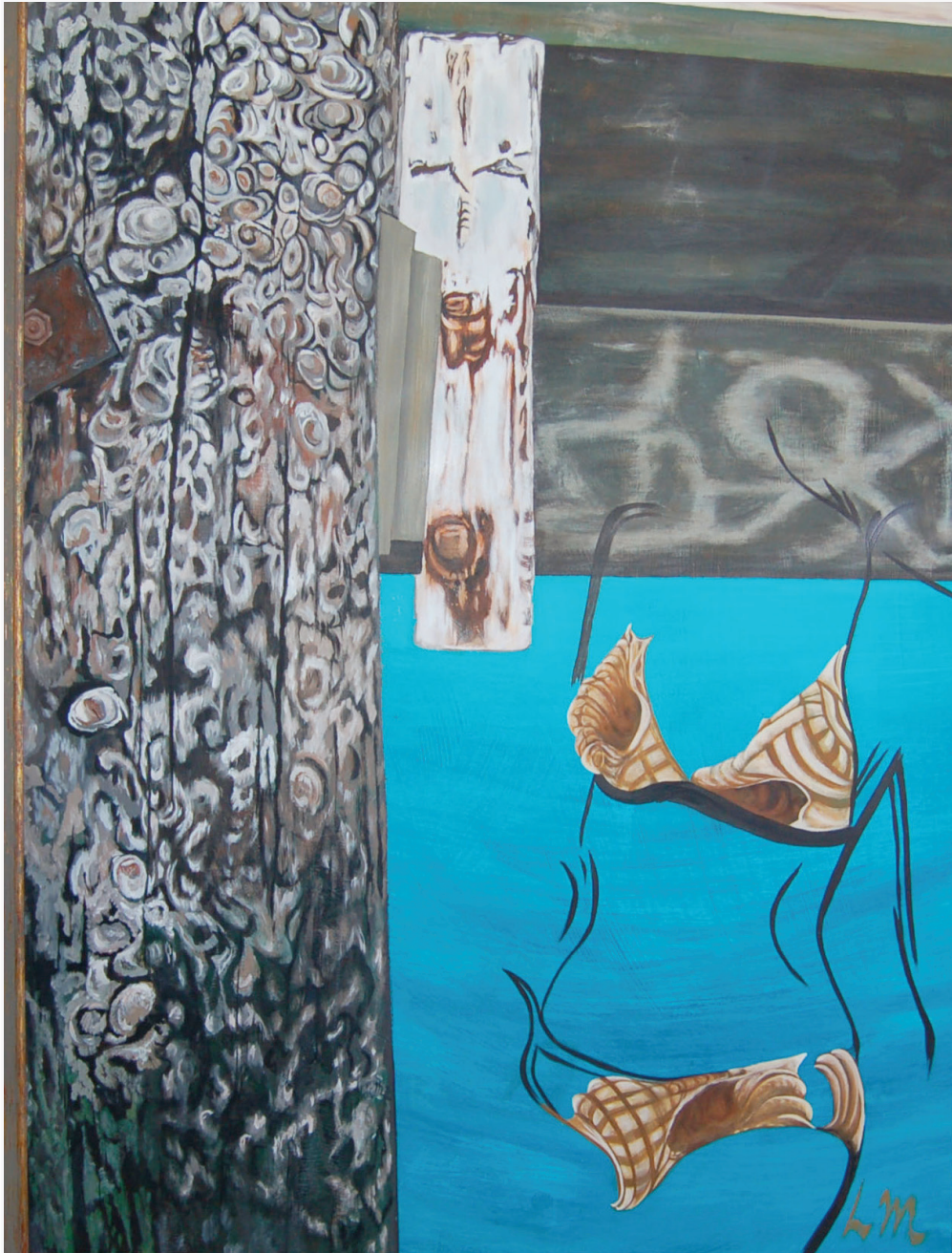
Swimming off the Wharf 134 x 102 cm