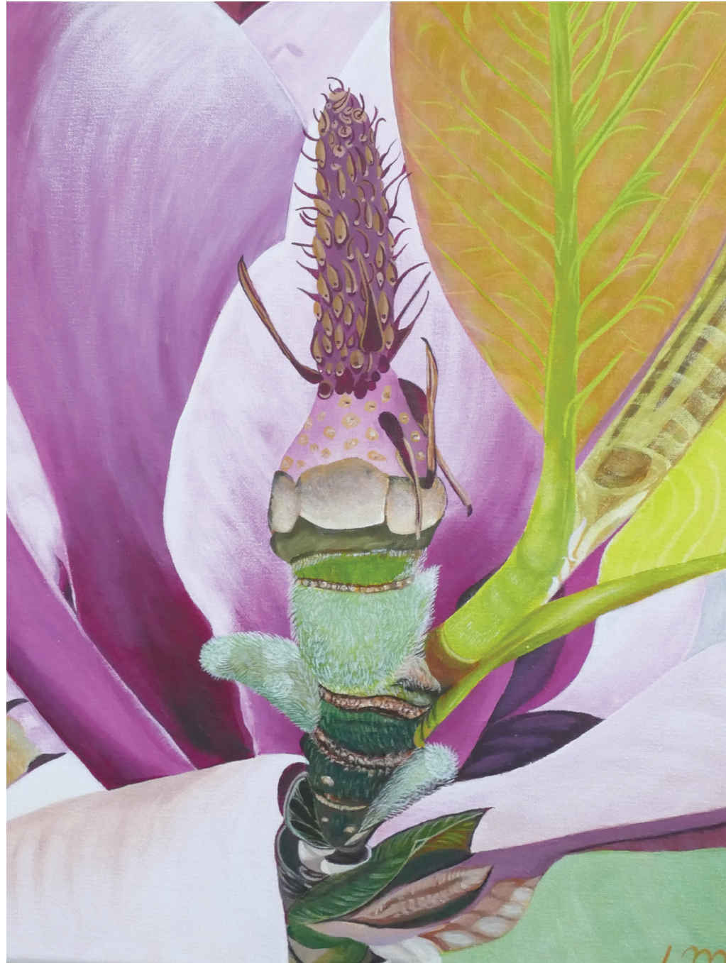
Ovule 76 x 110 acrylic on canvas