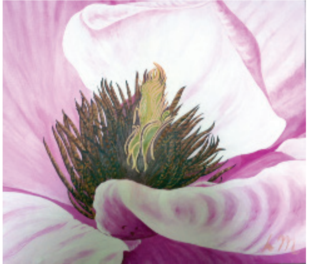
Anthers 53cm x 63cm acrylic on canvas