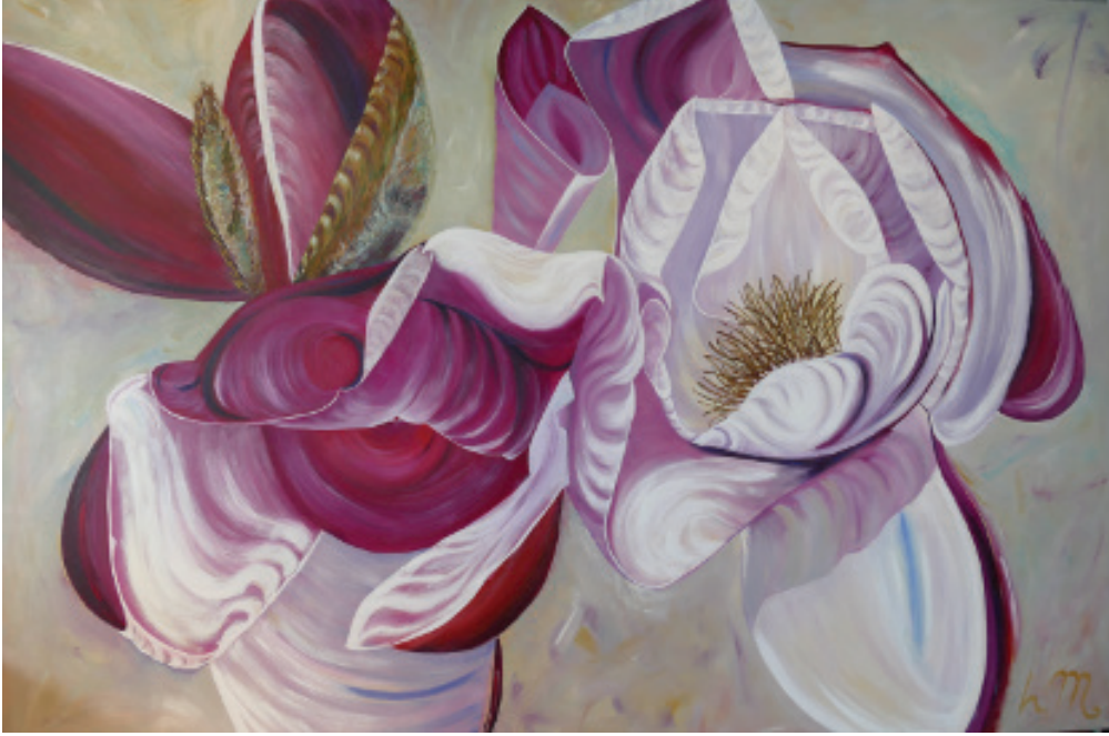
Magnolias large violet 160cm x 81 cm acrylic on canvas