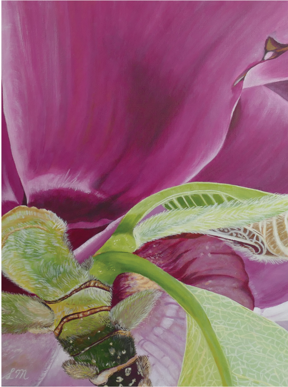
Behind the Scene 35 x 46 cm acrylic on canvas