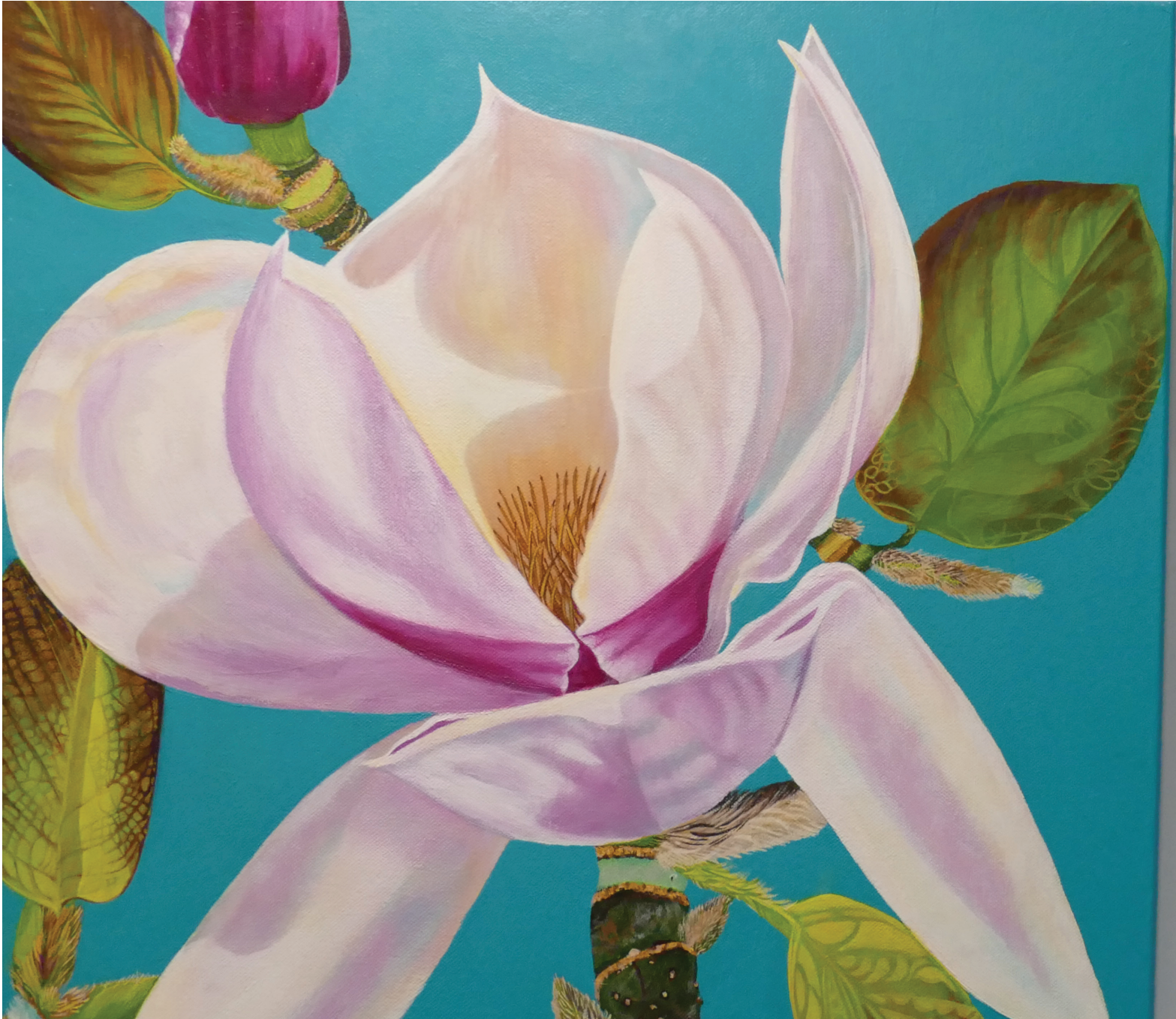
Magnolias Teal Small 50 cm x 50 cm acrylic on canvas