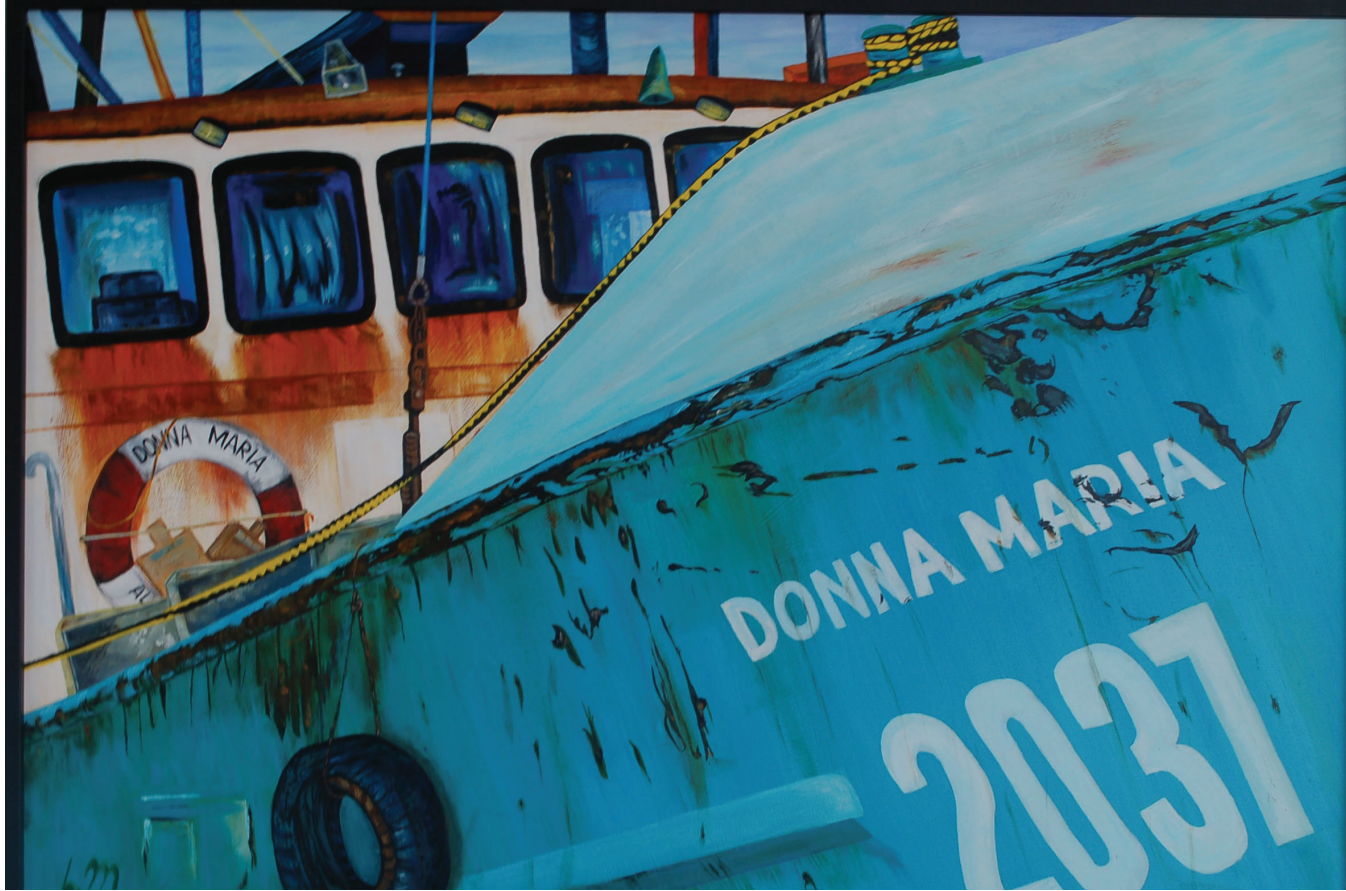
2037 acrylic on board