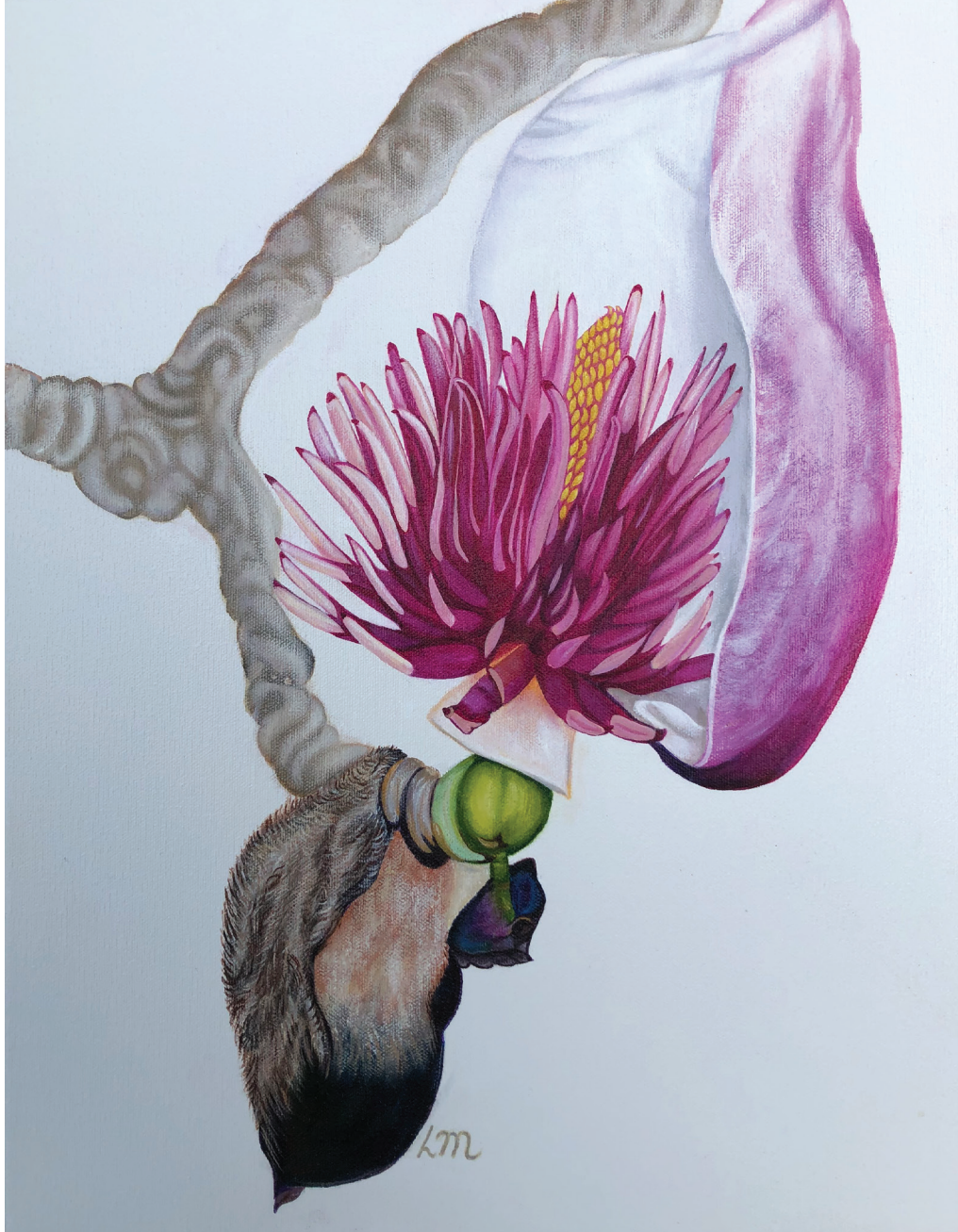
Seed Pod 35cm x 45