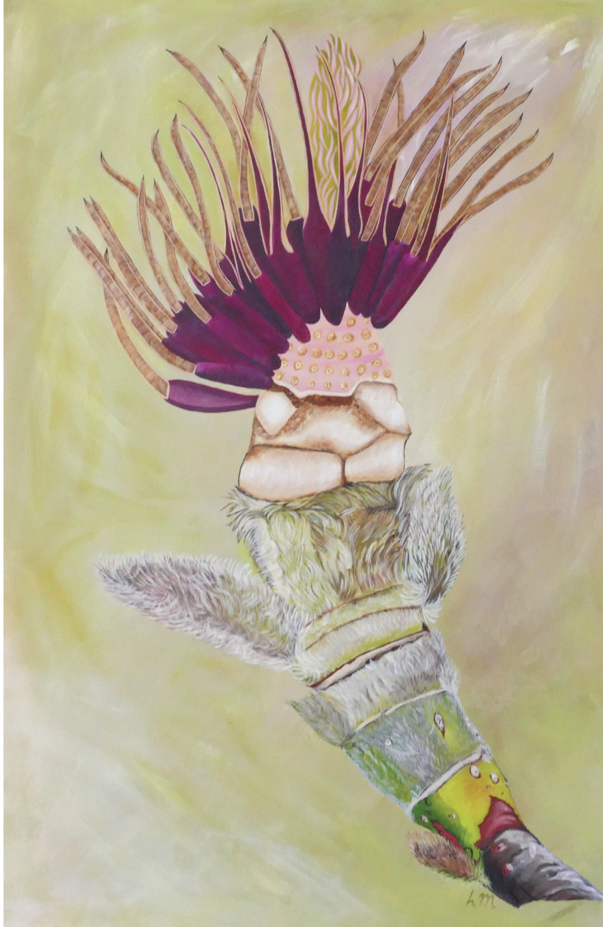
Complimentay Colours 61 cm x 91 acrylic on canvas