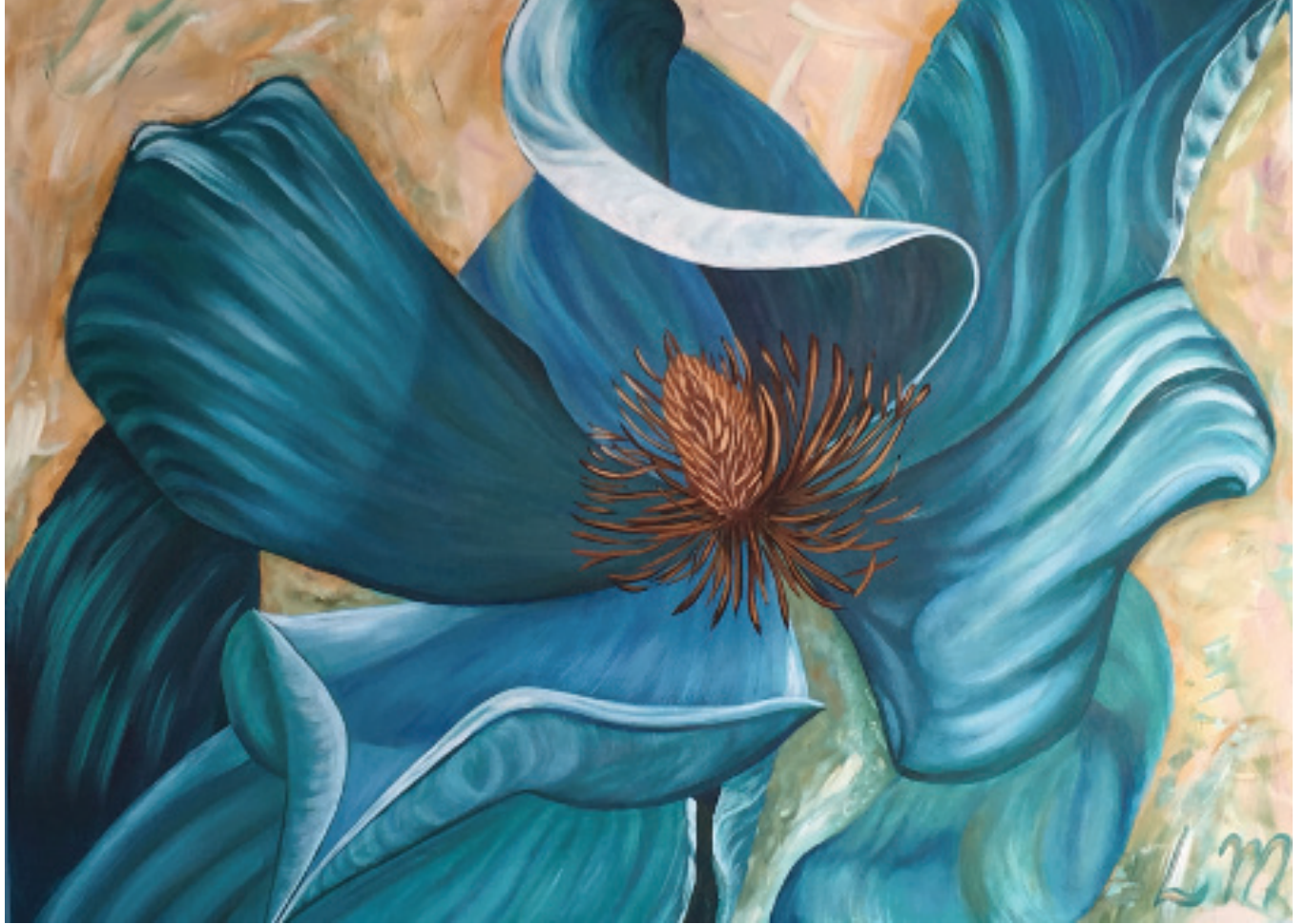
Blue Propagation 102 cm x 76cm acrylic on canvas