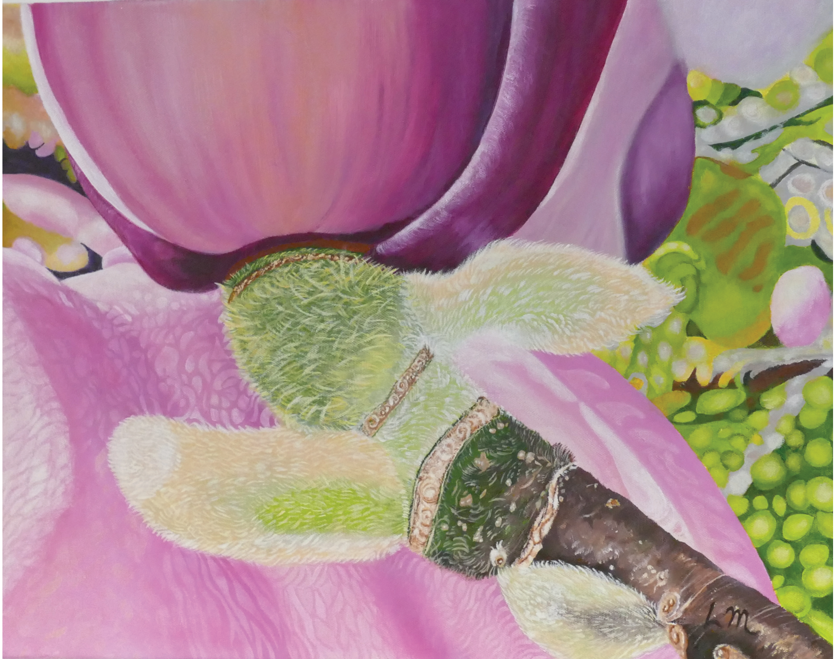
Pendacle 46 cm x 35 acrylic on canvas