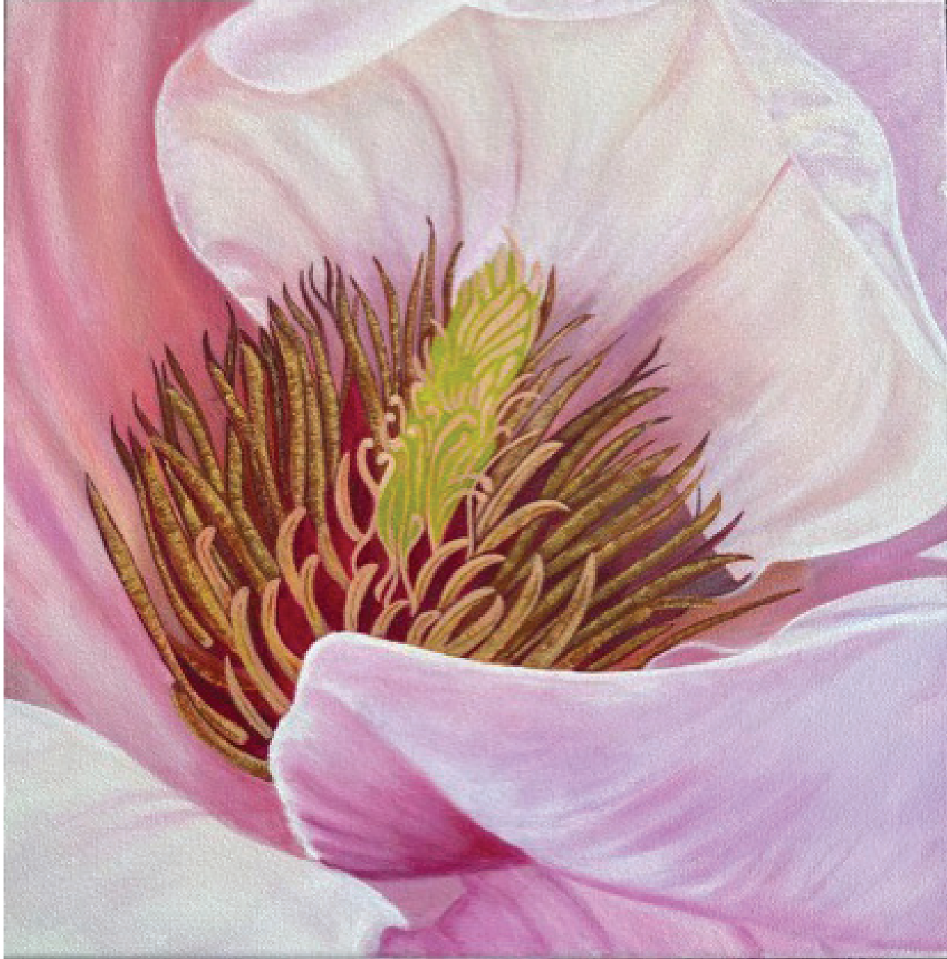
Heart 31 x 31cm acrylic on canvas