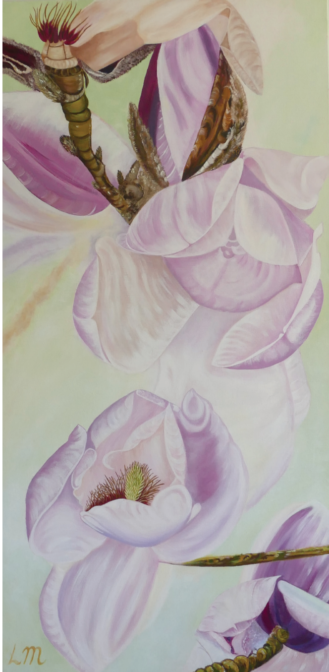
Harmony 61 x 122 cm acrylic on canvas