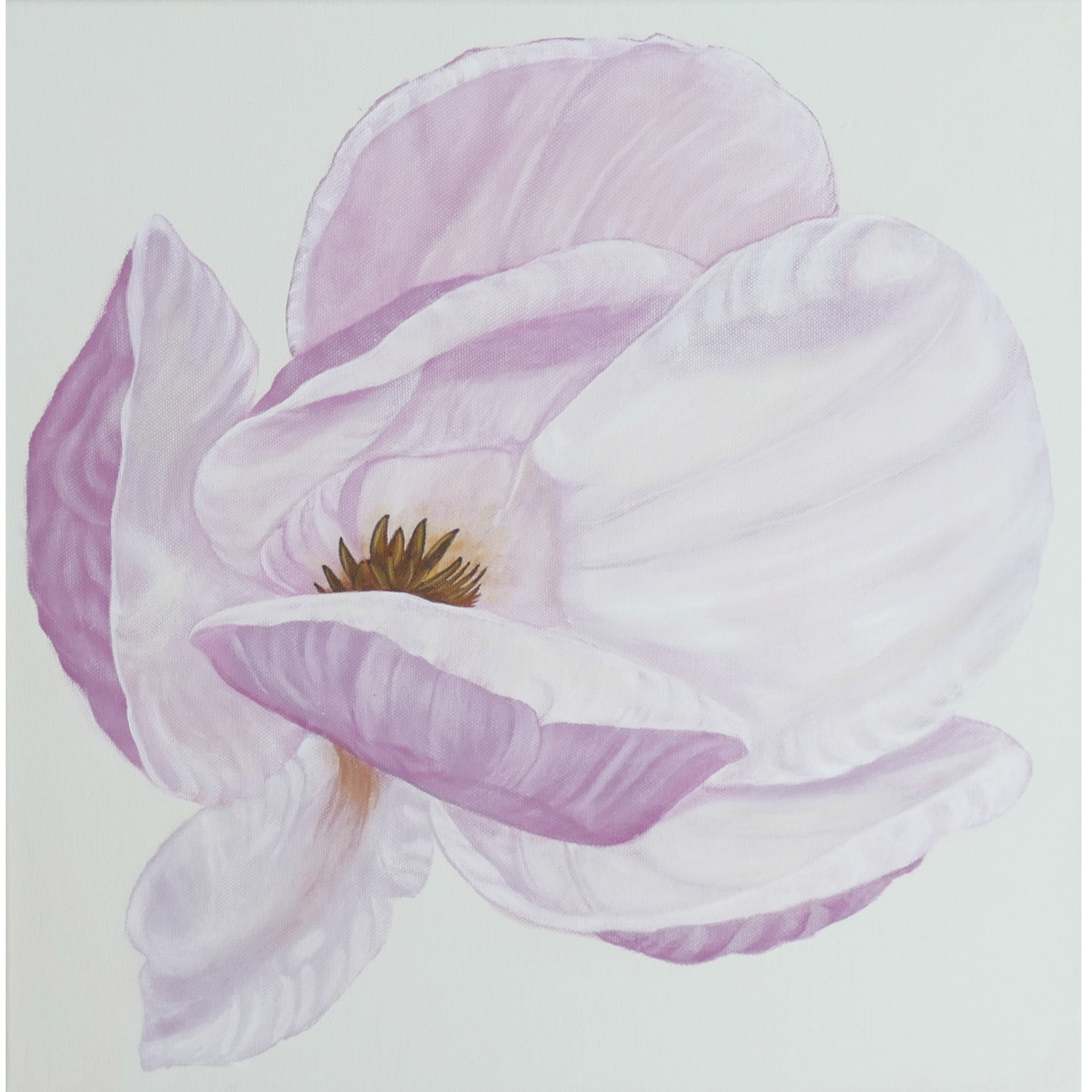
Full Bloom 45 x 45 cm acrylic on canvas