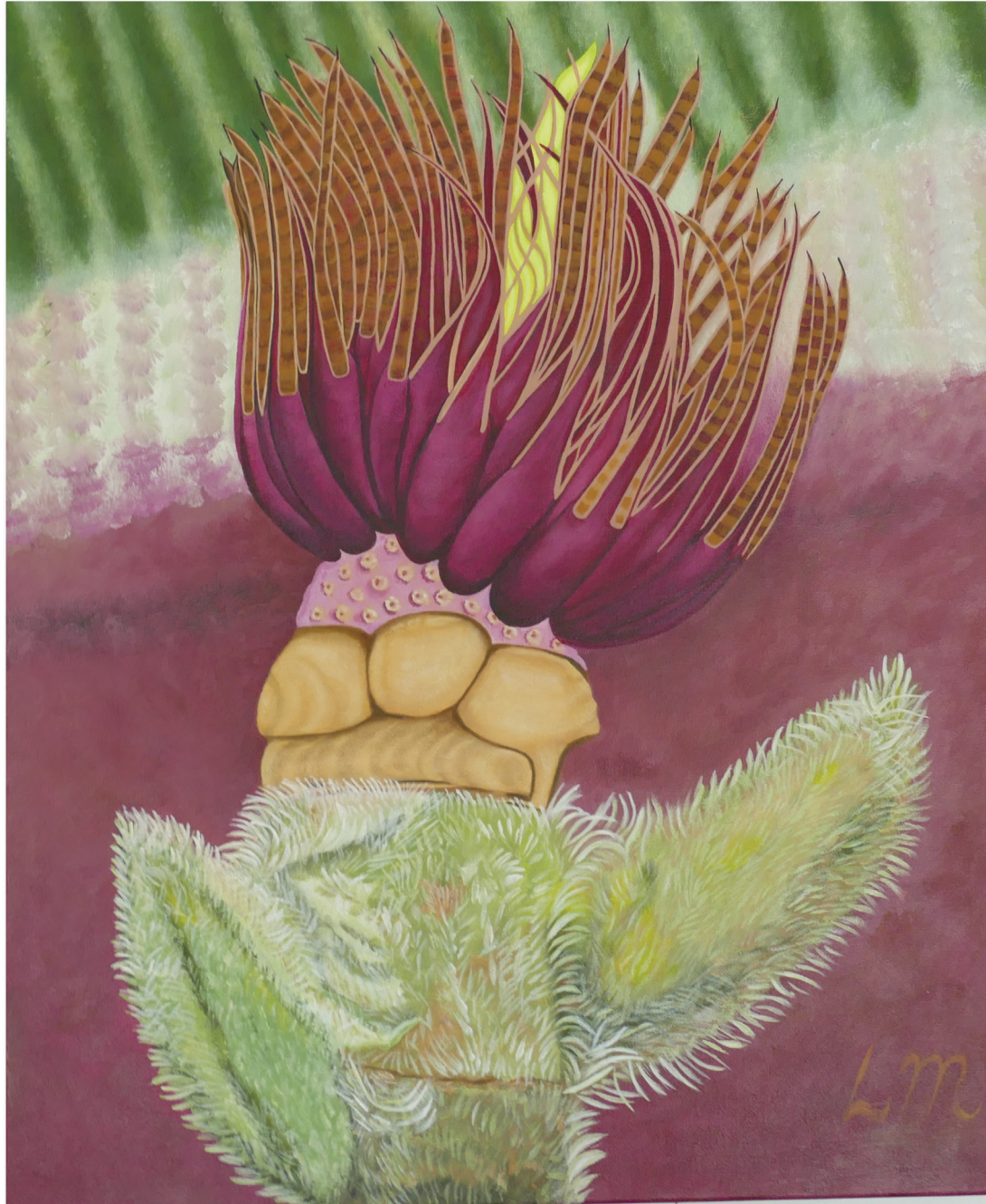
Fallen Petal 51 x 61 cm acrylic on canvas