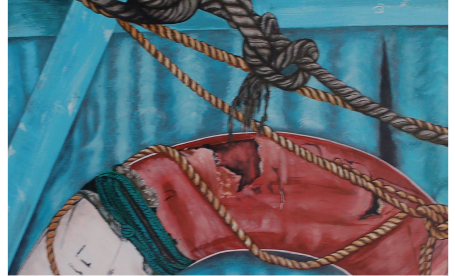
Life Buoy Acrylic on board 62 x 89 cm