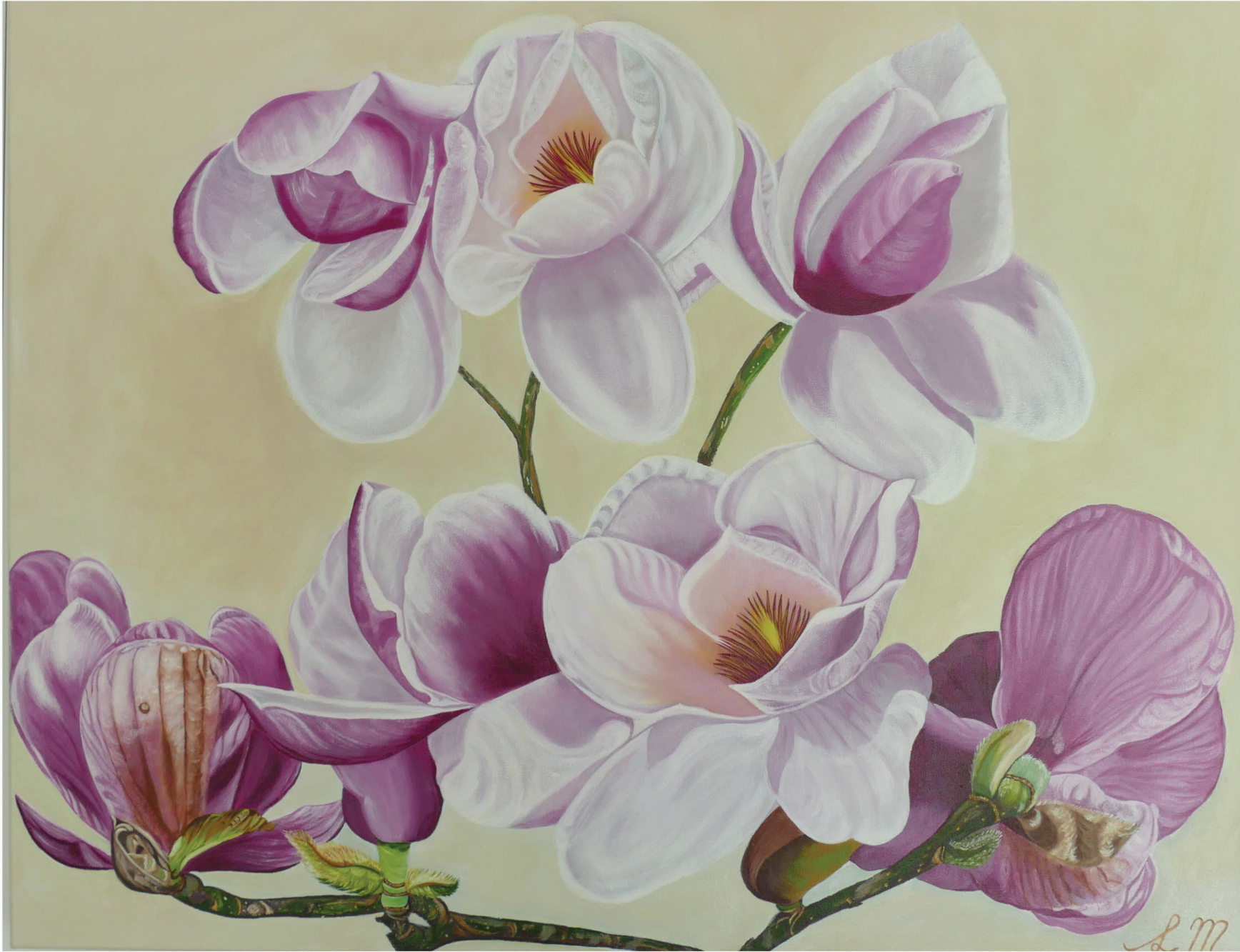
Many Angels 76 x 61 cm acrylic on canvas