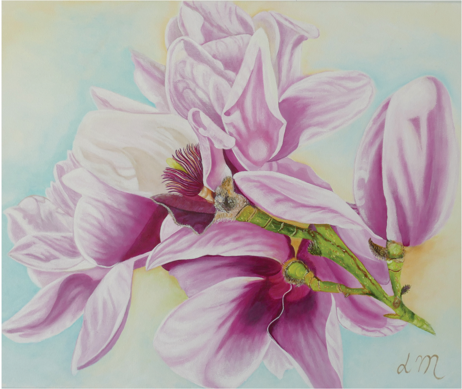
Back View 61 x 51cm acrylic on canvas