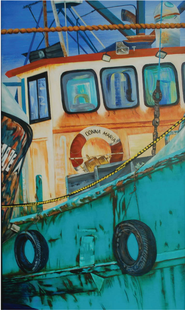
Donna Maria 55 x 110 cm acrylic on board