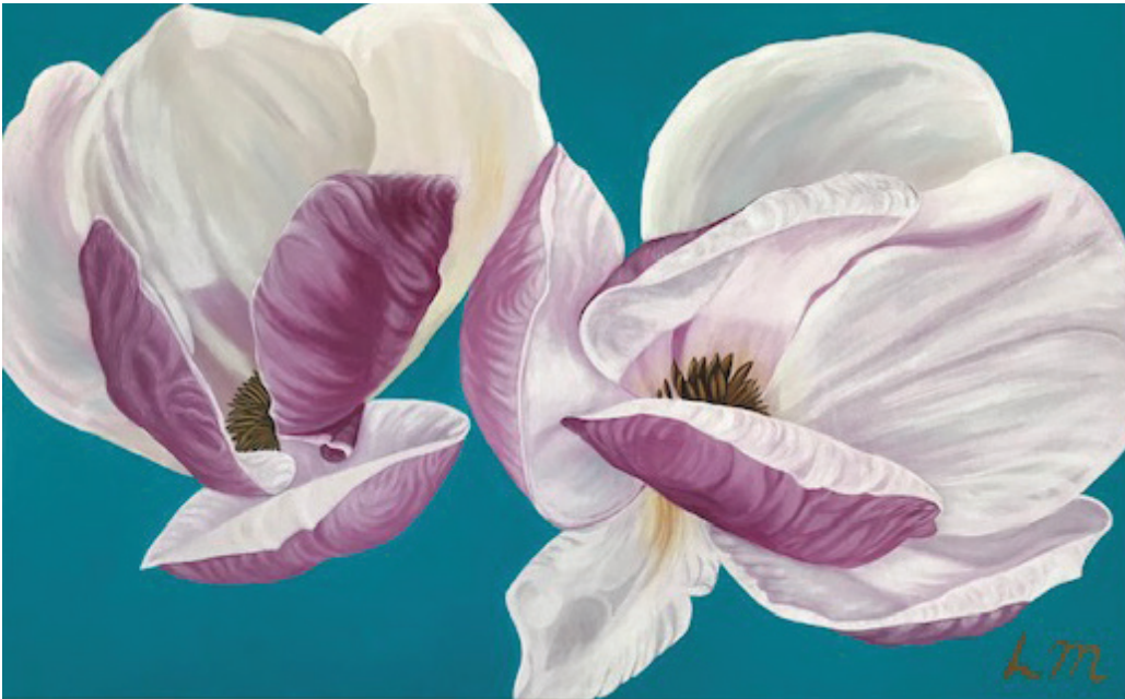
Floating 102 cm x 76 cm acrylic on canvas