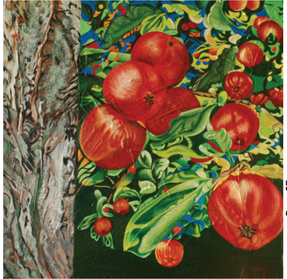
Apples Disappearing like Balloons in the Sky 76x 76cm acrylic on canvas