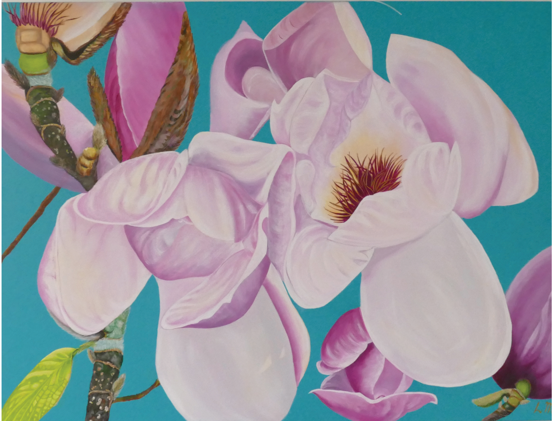
Magnolias Teal 106 cm x 66 cm acrylic on canvas