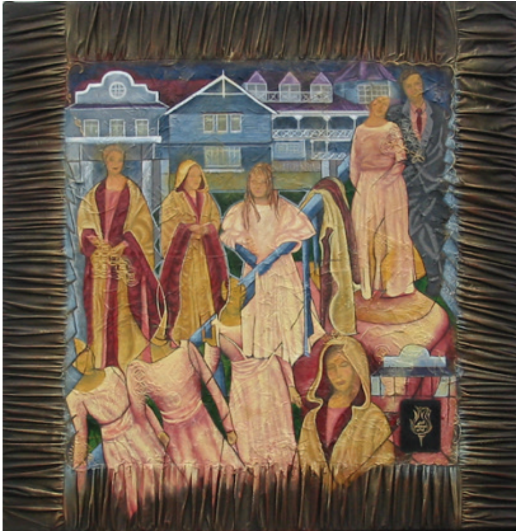
The Hotel 75 x 75 cm acrylic on canvas