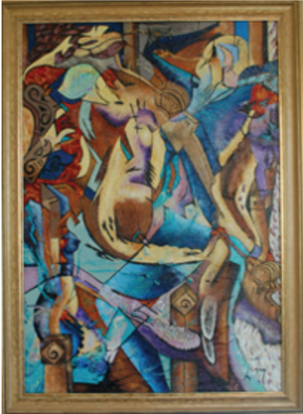
Birds of a Feather 80 x 110 cm