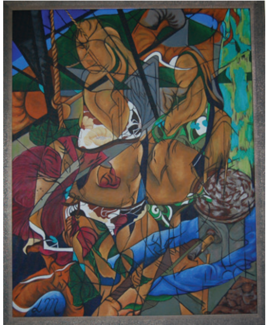
Bodies 69 x 100 cm acrylic on board