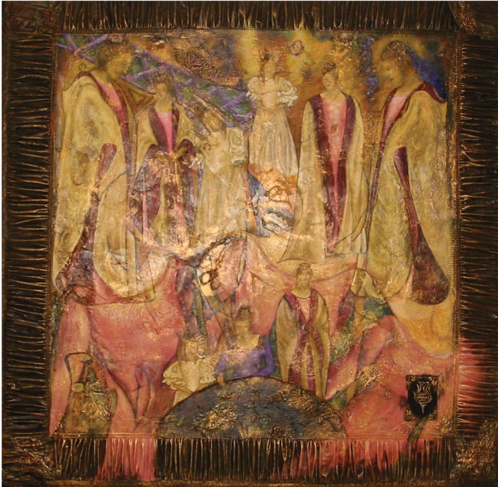
The ceremony” 2 Acrylic on canvas 112 cm x 112 cm NZ Patent©