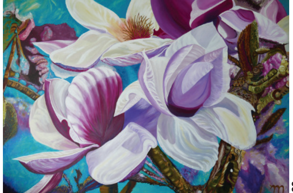
Millie's Magnolias 160 cm x 81 cm acrylic on canvas