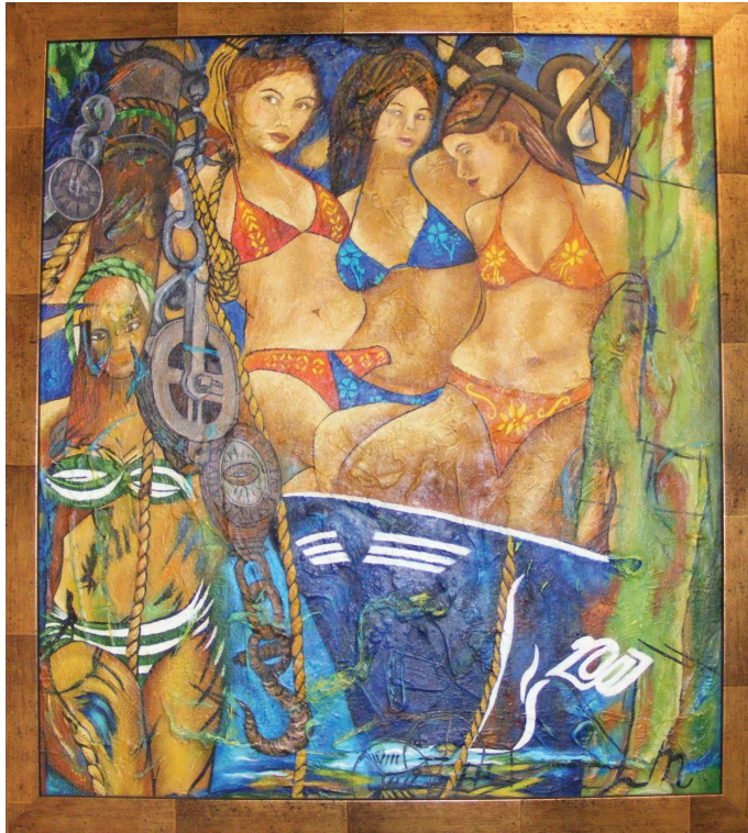
In The Navy 69 x 76 cm acrylic on board