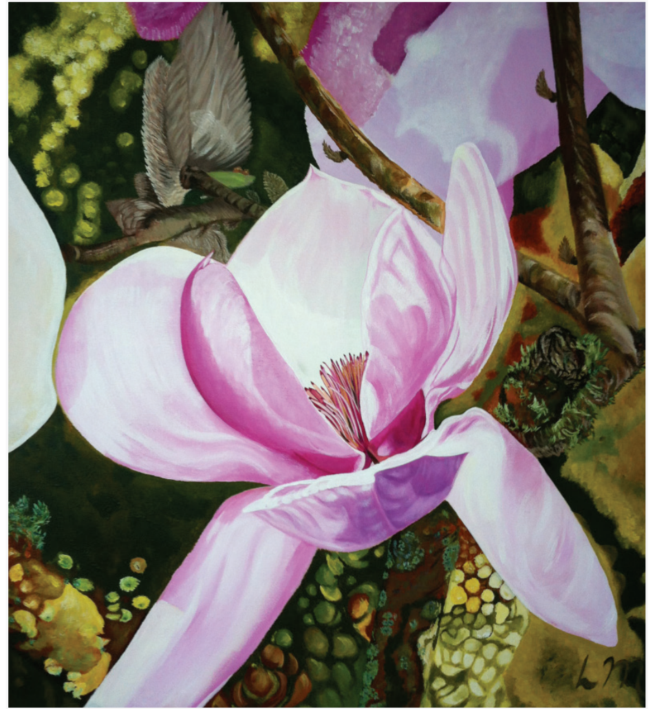
Pruned 76 x 76 cm acrylic on canvas