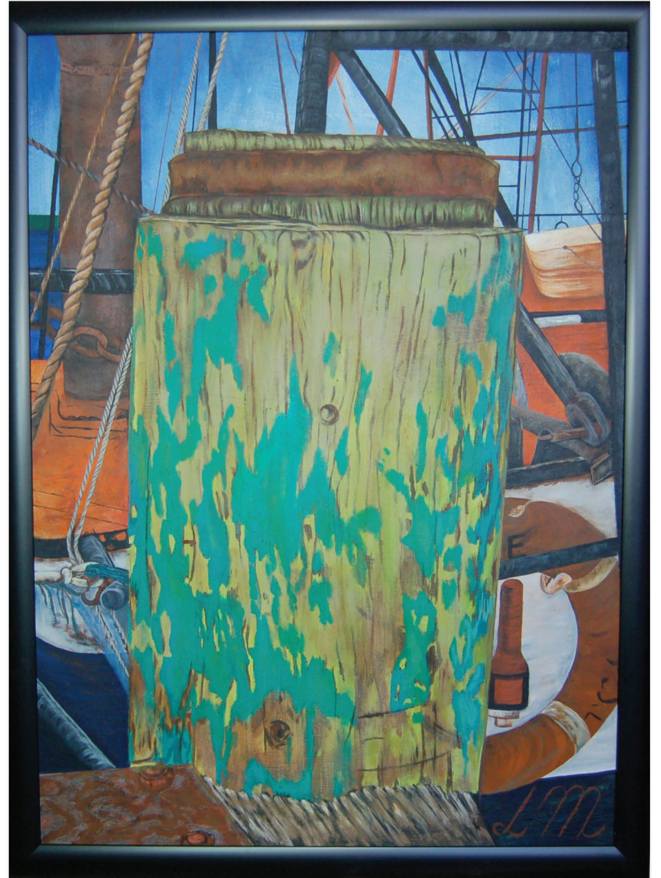
Bollard 75 x 101 cm acrylic on board