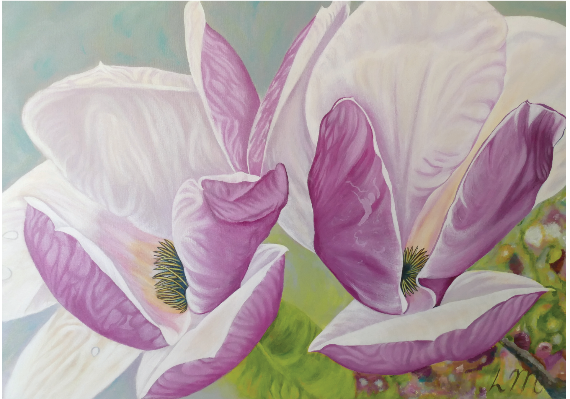
Sepal 92 cm x 61cm acrylic on canvas