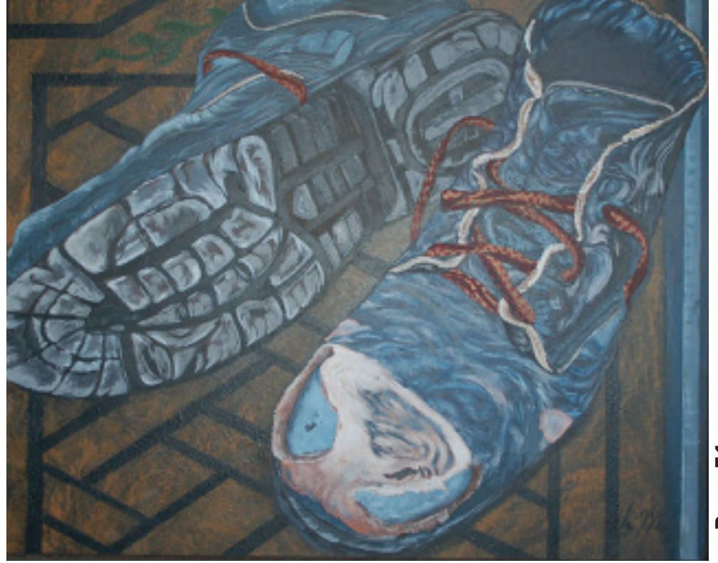
Mikes Boots 54 x 64 cm acrylic on board