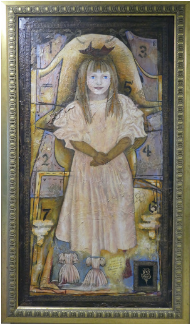
Simply Silk 1 63 x 123 cm acrylic on board