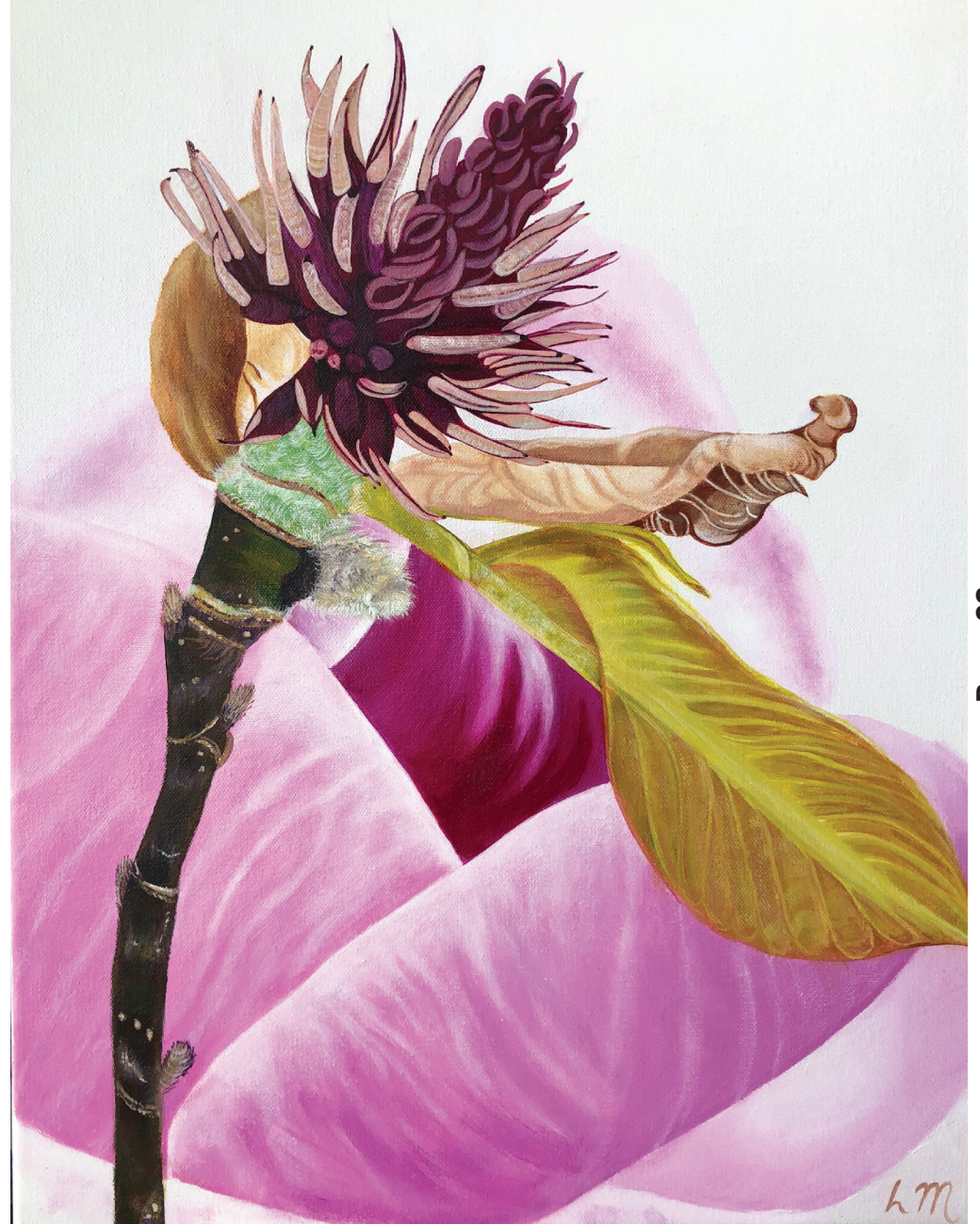
Style 35cm x 45cm