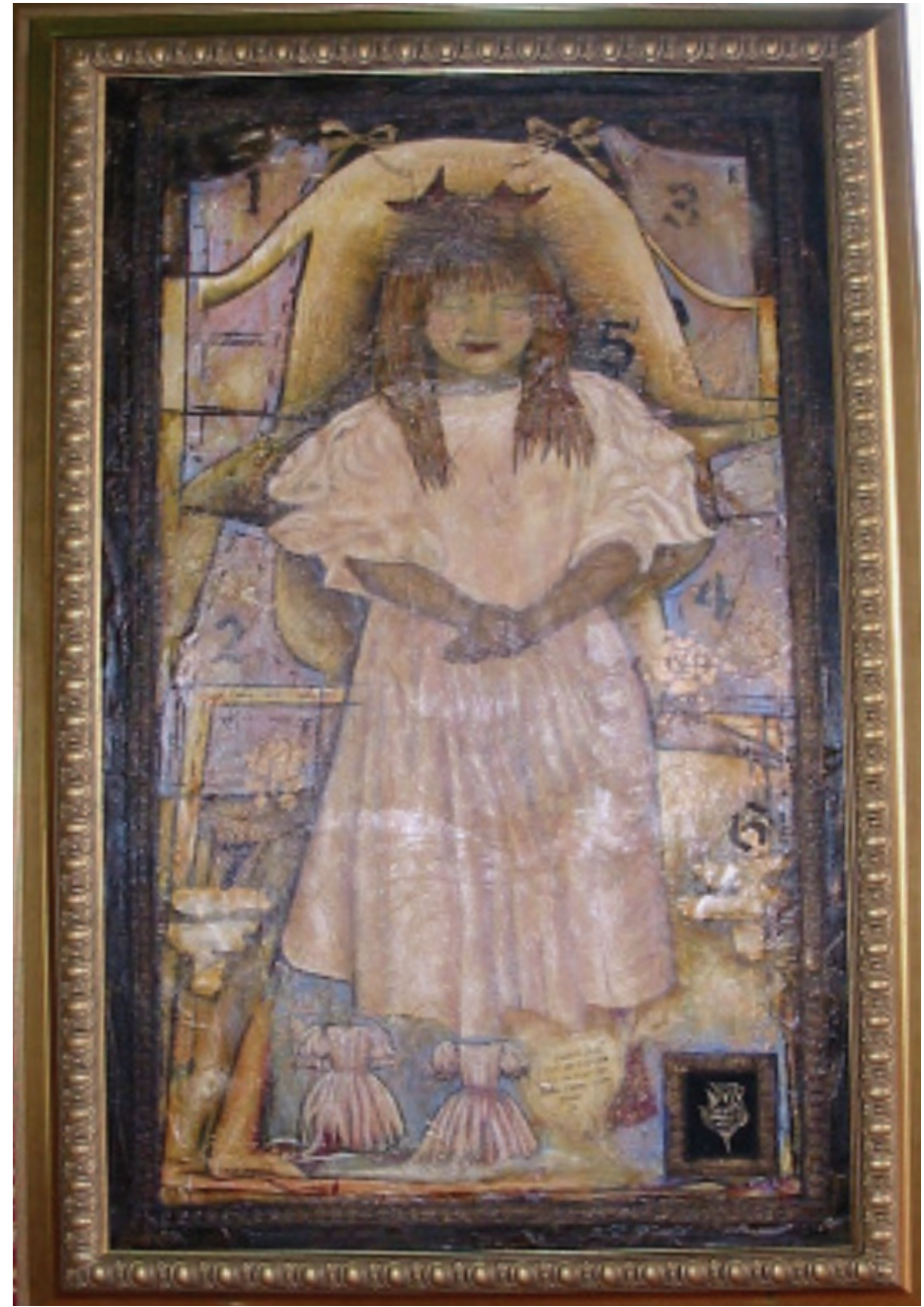
Simply Silk 2005 65 x 122 cm acrylic on board