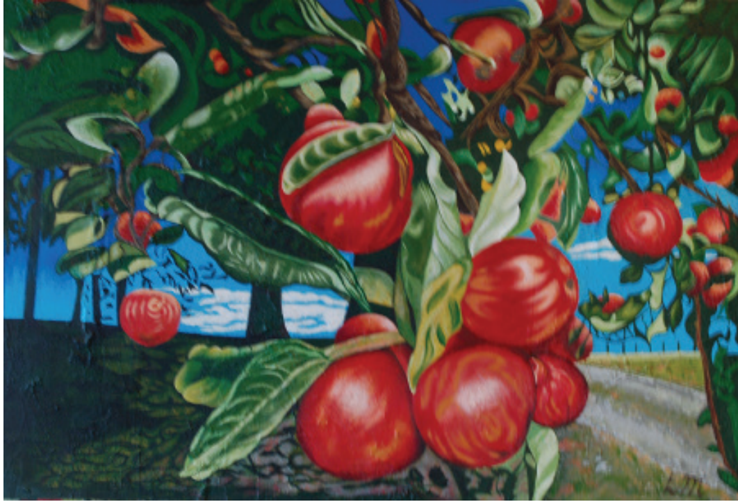
Apples up our Driveway 54 cm x 78 cm acrylic on board