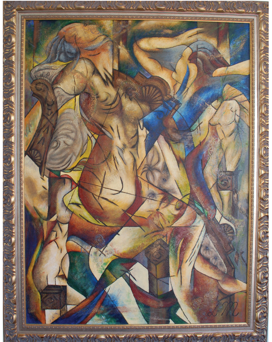
Body of paint